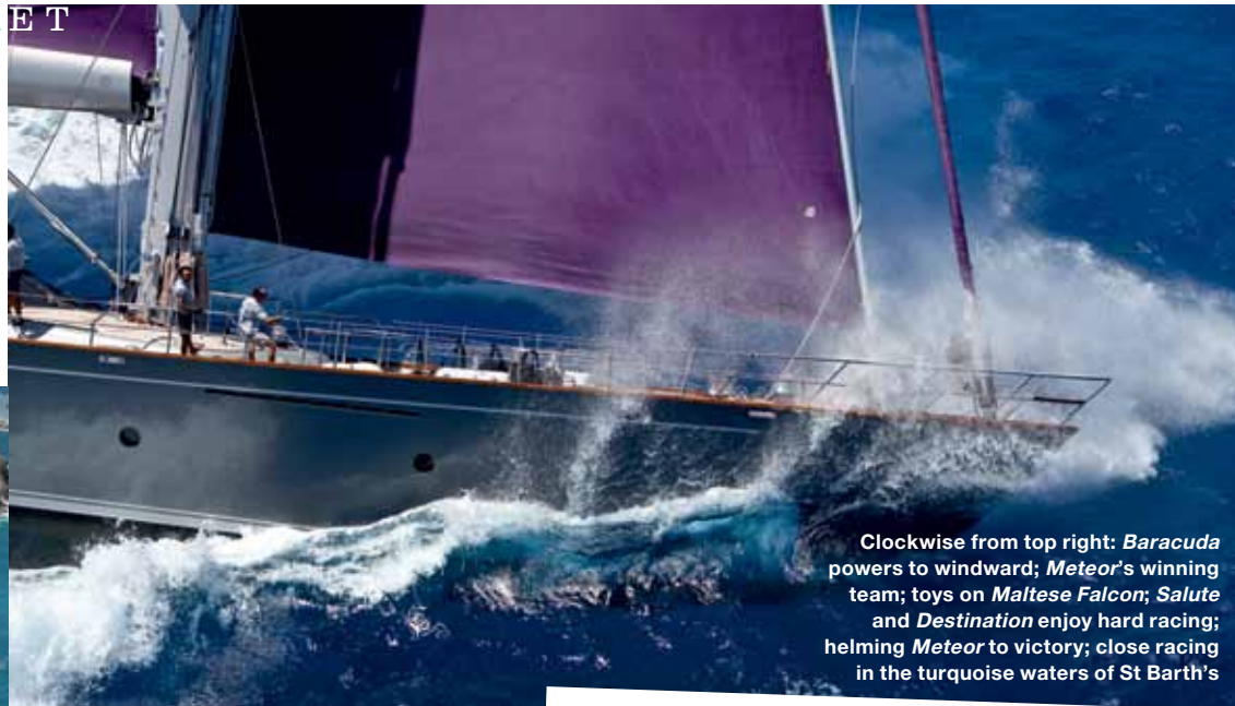
Clockwise from top right: Baracuda powers to windward; Meteor's winning team; toys on Maltese Falcon ; Salute and Destination enjoy hard racing; helming Meteor to victory; close racing in the turquoise waters of St Barth's

Owner of P2 after the yacht's very first day of racing