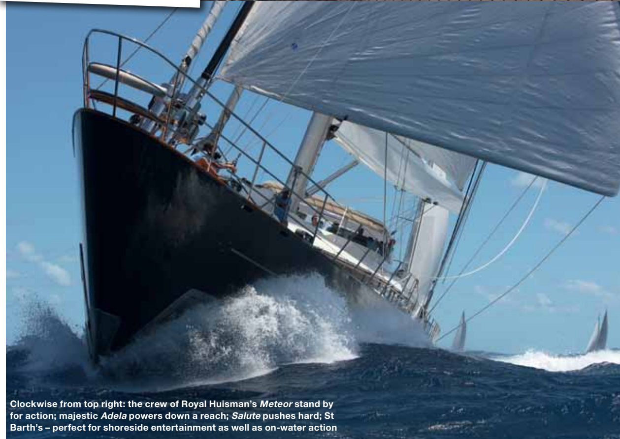
Clockwise from top right: the crew of Royal Huisman's Meteor stand by for action; majestic Adela powers down a reach; Salute pushes hard; St Barth's – perfect for shoreside entertainment as well as on-water action