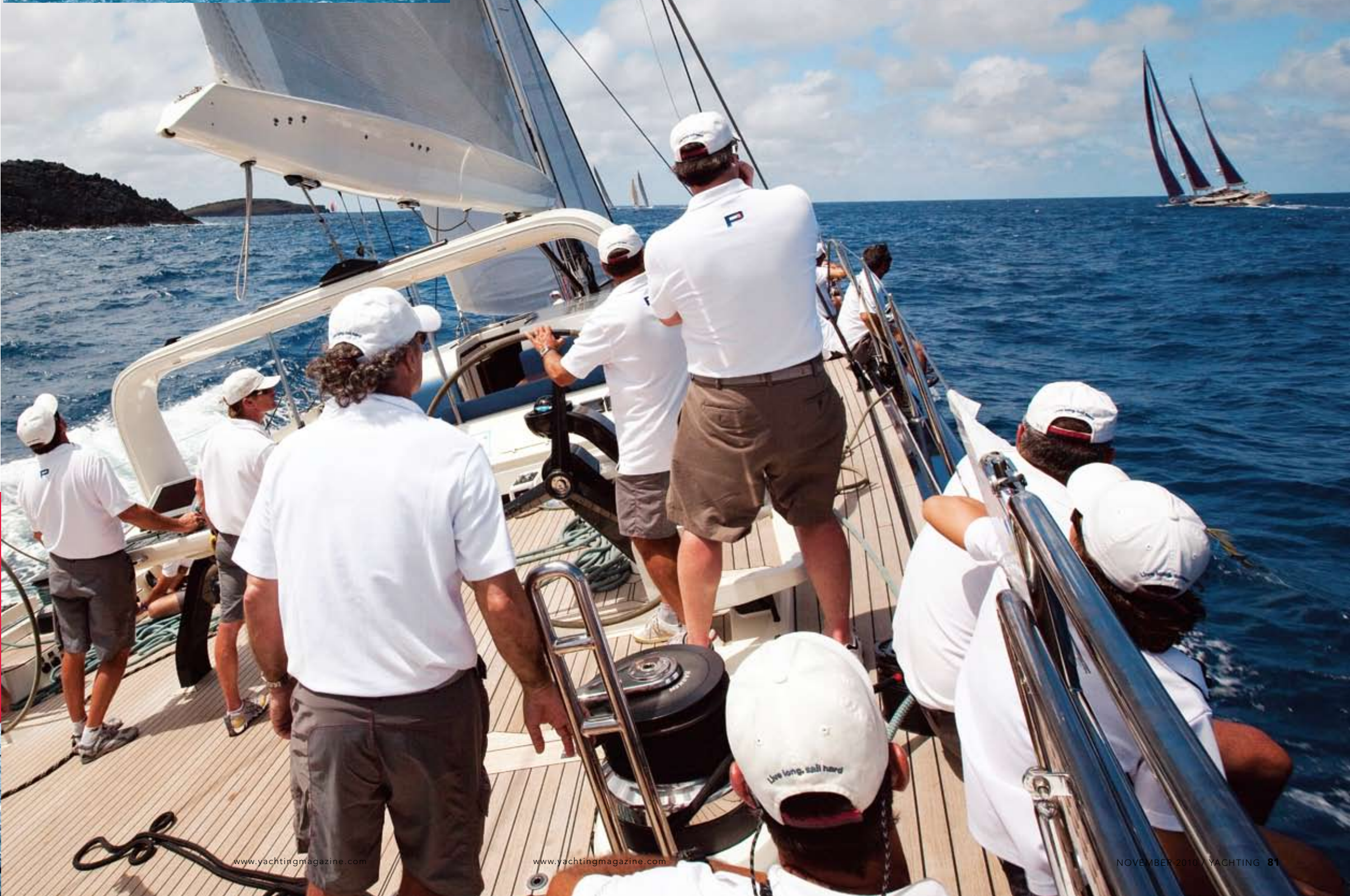
CLOCKWISE FROM INSET, THE 1930 M/Y ATLANTIDE CHECKS OUT THE ACTION — SHE IS ONLY ONE OF THE MANY GORGEOUS YACHTS THAT COME TO WATCH THE BUCKET; THE CREW OF THE 38-METER PERINI NAVI P2, WHICH WAS LAUNCHED IN 2008, FOCUSES ON THE CHASE AS THEY ATTEMPT TO GAIN ON BARRACUDA; P2'S RED SPINNAKER IS NOT A SIGHT COMPETITOR'S LIKE TO SEE COMING UP FROM BEHIND.